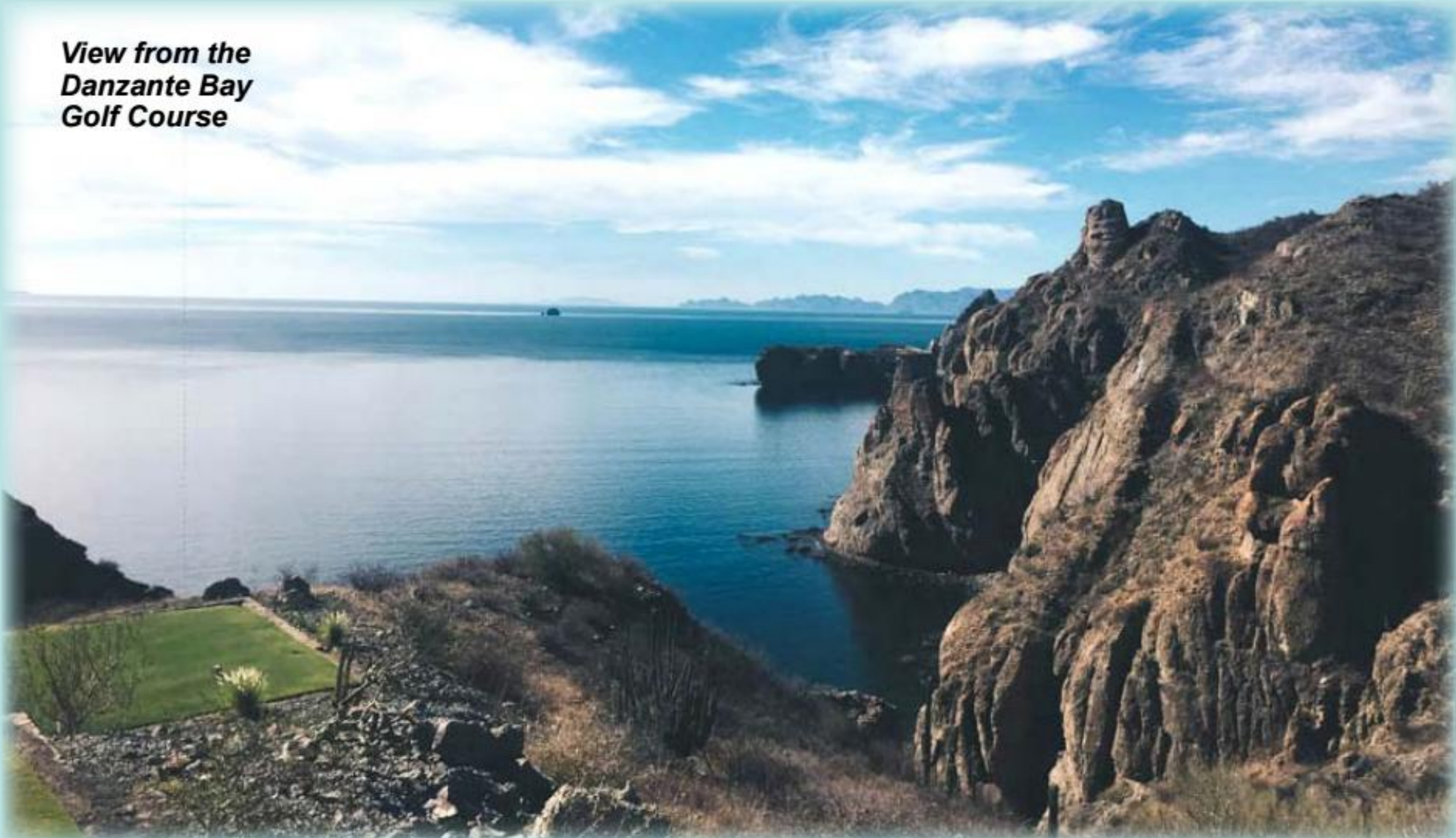
View from the Danzante Bay Golf Course

For more hotels and tours in this area contact the tourism board: Discover Baja California www.discoverbajacalifornia.com Phone. (664) 682-3367